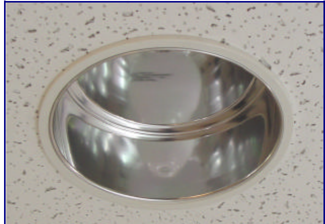
R15000 Series Open Downlight Without Baffle

SPECIFICATIONS SUBJECT TO CHANGE WITHOUT NOTICE