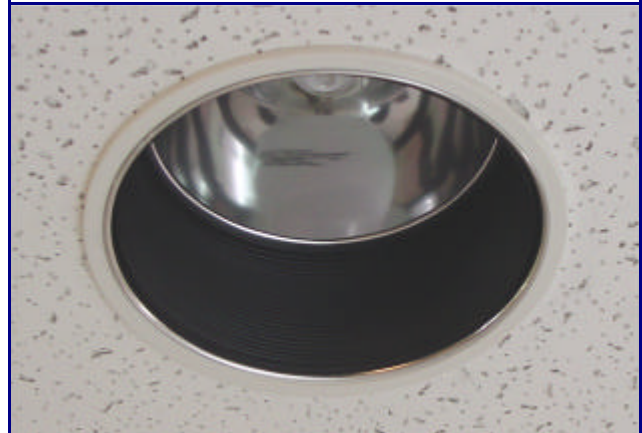
R15100 Series Open Downlight With Baffle