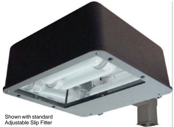
Shown with standard Adjustable Slip Fitter

SPECIFICATIONS SUBJECT TO CHANGE WITHOUT NOTICE