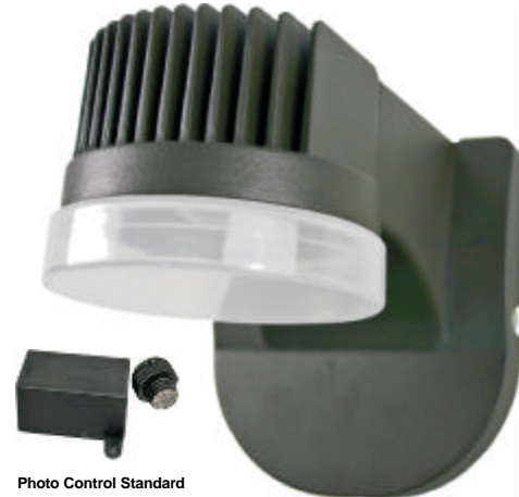
Photo Control Standard

Applications: Ideal for indoor or outdoor use in condos, apartments, hotels, walkways and porches.