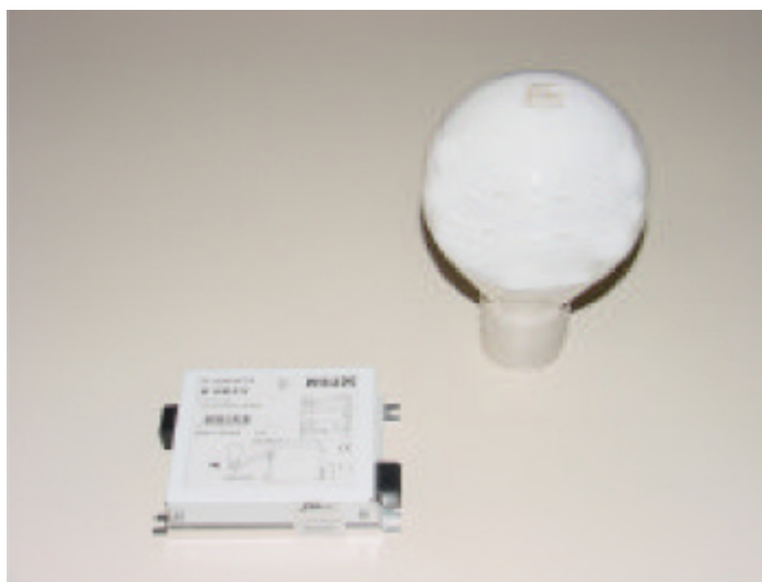
PHILIPS QL INDUCTION LAMP AND HIGH FREQUENCY ELECTRONIC BALLAST SYSTEM