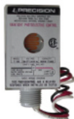
Photo Control Suffix Cat.# With 120 Volt = PC1 208-277 Volt = PC2