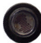
Photo Control Add suffix "PC" to order number. *Specify 120v or 277v

Fuse and Fuse Holder Add suffix "F" to order number.