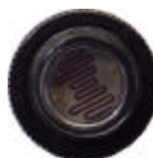
Photo Control Add suffix "PC" to order number. *Specify 120v or 277v

Fuse and Fuse Holder Add suffix "F" to order number.