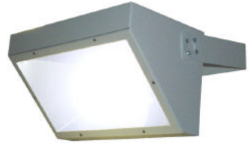
Clear tempered glass lens, Shown with trunion mount option.

SPECIFICATIONS SUBJECT TO CHANGE WITHOUT NOTICE