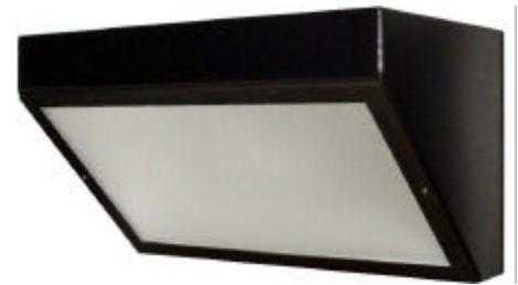
Prismatic C73 tempered glass lens, Shown with collar mount option.