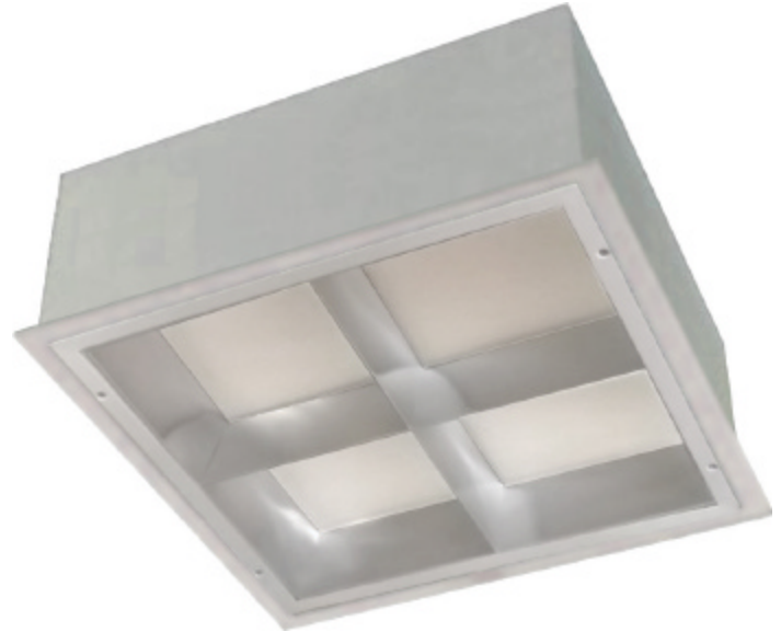
Shown with four cell parabolic louver and prismatic glass lens.

SPECIFICATIONS SUBJECT TO CHANGE WITHOUT NOTICE