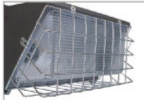
Wire Guard Option Cat.# WP708WG