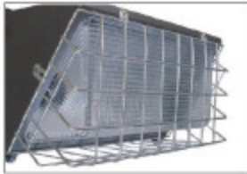
Wire Guard Option Cat.# WP707WG