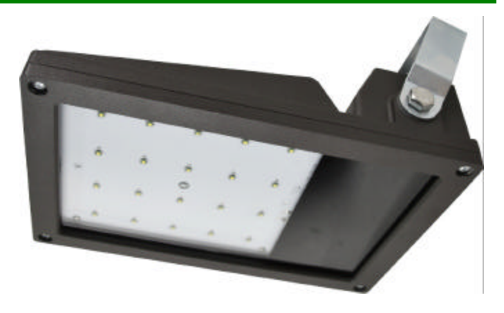
Applications: Ideal for signage or general illumination.

SPECIFICATIONS SUBJECT TO CHANGE WITHOUT NOTICE