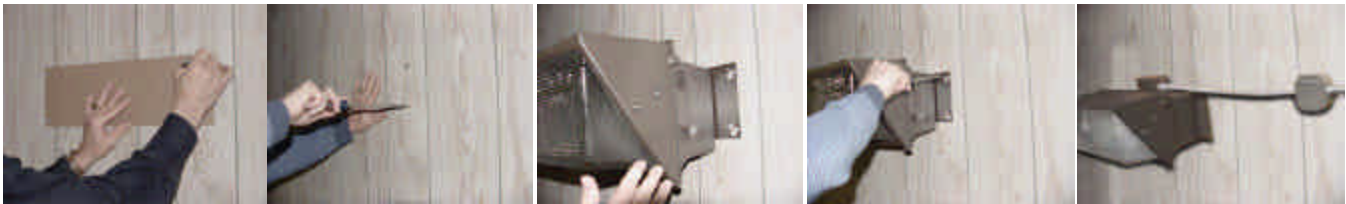
STEP 1. Mark wall with supplied template.

EZ5 Surface Power Supply Installation: Factory installed 12 gauge steel wall mounting brackets with 4 keyhole slots, finished the same as the housing. Metal template for locating the mounting brackets. Factory installed junction splice box, tapped for either 1/2" or 3/4" (must specify) liquid-tight connector suitable for wet location.