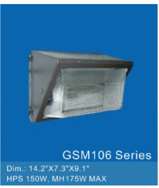
Application: Ideal for parking areas, entrances, walkways, underpasses, loading docks and tunnels.